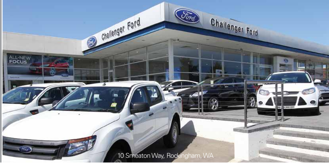
10 Smeaton Way, Rockingham, WA