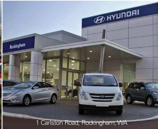
1 Carlston Road, Rockingham, WA