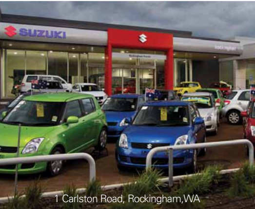
1 Carlston Road, Rockingham, WA