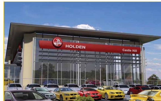
Artists impression Castle Hill Holden