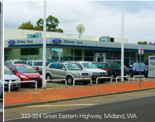
322-324 Great Eastern Highway, Midland, WA