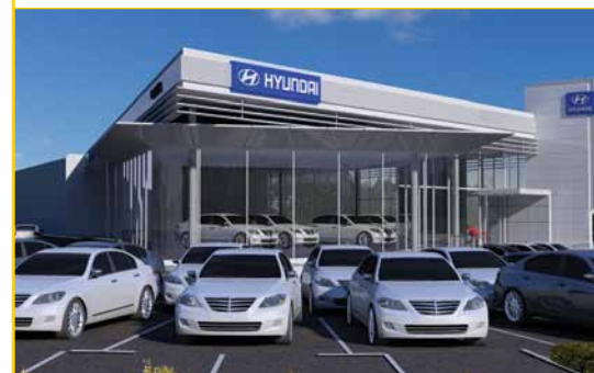
Artists impression Castle Hill Hyundai